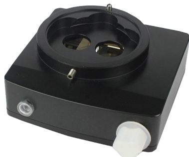
BIOM Kit optional